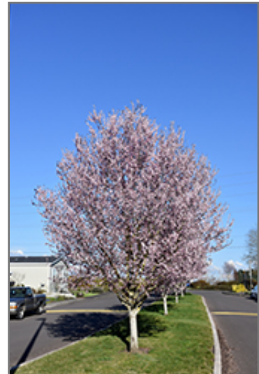
Krauter Vesuvius Plum in bloom

This tree will require occasional maintenance and upkeep, and is best pruned in late winter once the threat of extreme cold has passed. It is a good choice for attracting birds to your yard. Gardeners should be aware of the following characteristic(s) that may warrant special consideration;