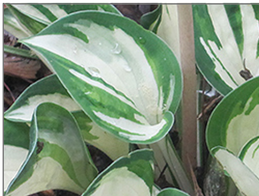
Pandora's Box Hosta foliage