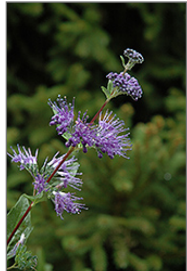
Blue Mist Caryopteris flowers

Blue Mist Caryopteris is recommended for the following landscape applications;