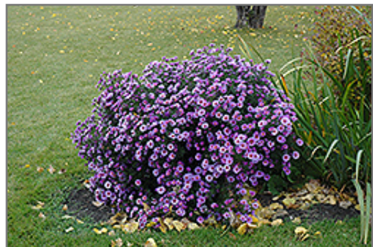
Purple Dome Aster in bloom