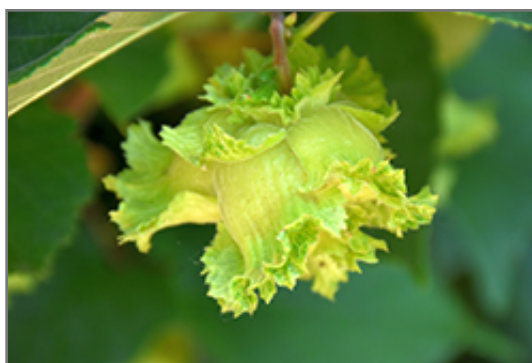
American Hazelnut fruit