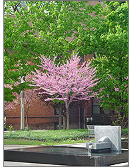
Eastern Redbud (tree form) in bloom

Eastern Redbud (tree form) is recommended for the following landscape applications;